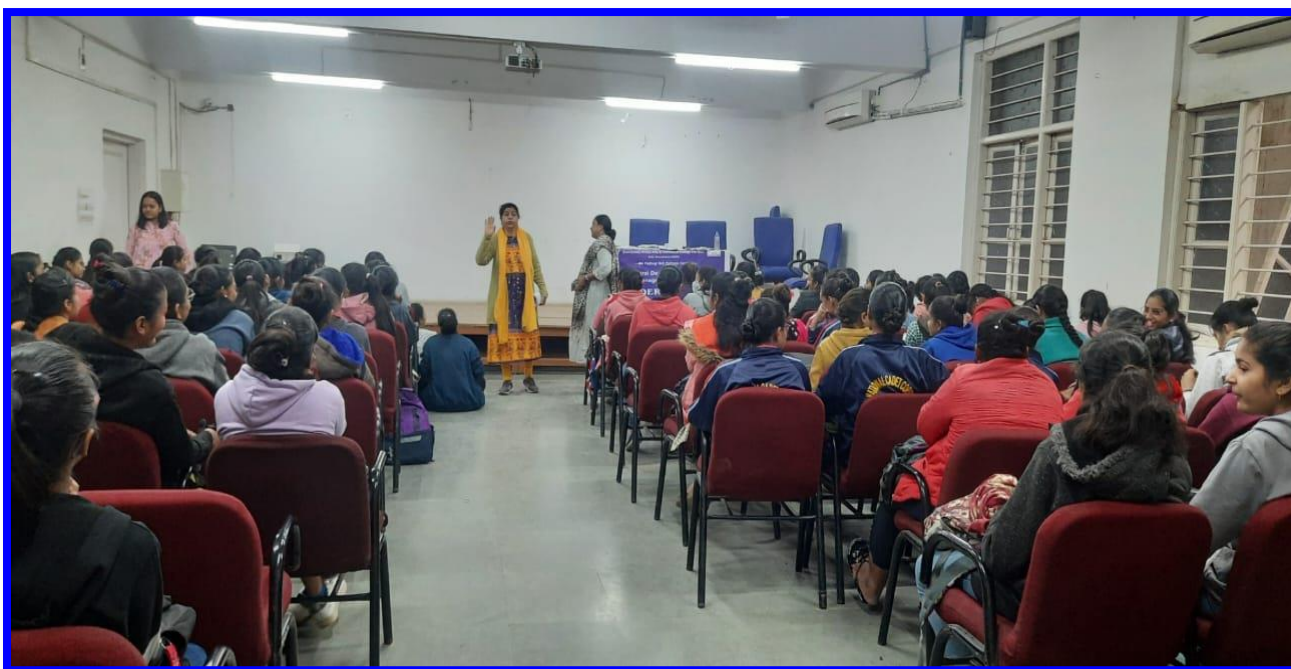
Training on “Understanding Gender Equality” at Umiya Arts and Commerce Grills College

Education is no longer confined to the single subject and syllabus designed for classroom teaching. A multidisciplinary approach and work experience are considered fundamental in education of any discipline and level. RUDMI signed MOU with Umiya Arts and Commerce Girls College in the year 2020 for three years and have renewed it again in Jan 2023 for another 3 years. The MOU is made to suggest, organize and conduct various cocurricular and excurricular educational programmes in accordance with National Accreditation system. Accordingly, several activities were conducted with students of Umiya Arts College. and have tried to improve learning outcome of the activity. We also provided work opportunity to the students. The corona pandemic affected this programme severely.