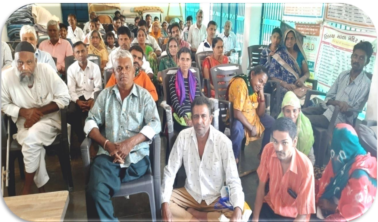
DSSP Training at Moriya, Ta.Vadgam Dist. Banaskantha

RUDMI has tried to build a network of Divyang of the state. Till now 800 divyang are part of this network. Around 30 message are sent about schemes, programs and entrepreneurial opportunities to these divyangs.