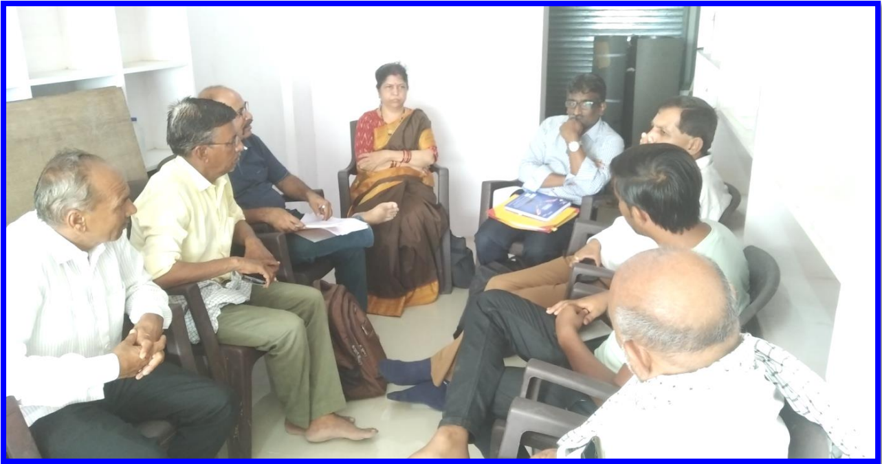
Meeting of the Project Monitoring Committee Appointed for FPO at Dasada

Farming is lifeline not only for rural economy but also for the national economy. Unfortunately, over the years the profitability of this sector is declining which has deserted villages and farmers. RUDMI started working with farmers in many villages of Dasada Taluka before more than 15 years. Around 500 farmers in fifteen village were mobilized to form 20 village level farmer's club each with membership of 20 to 25. Regular meetings were organized with experts to discuss the problems. The experts were invited to guide farmers and increase their awareness to new developments in this sector. RUDMI Also helped these farmers in connection with ATMA and Agriculture Department, Government of Gujarat, Agriculture Universities. The farmers participated in several agriculture fares and exhibitions.