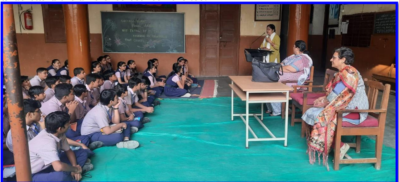
Counselling Session with Students of Diwan Ballubhai Higher Secondary School (Eng.) at Padli

This year we conducted EQ and SIS tests for divyang and normal students to understand the difference between the two.