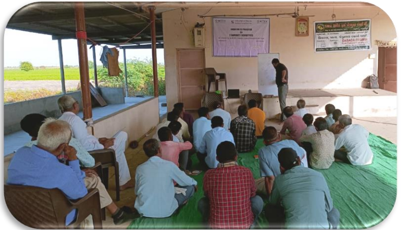
NCDX Training for Members of FPO at Dasada

Thus, the FPO promoted by RUDMI is working well and is enjoying A rank as per NABARD.