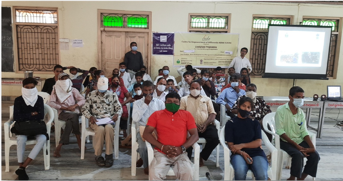
Livelihood Program for Divyangjan at Kheralu