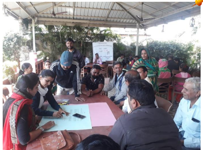
Basic Foundation Training At Paddhari