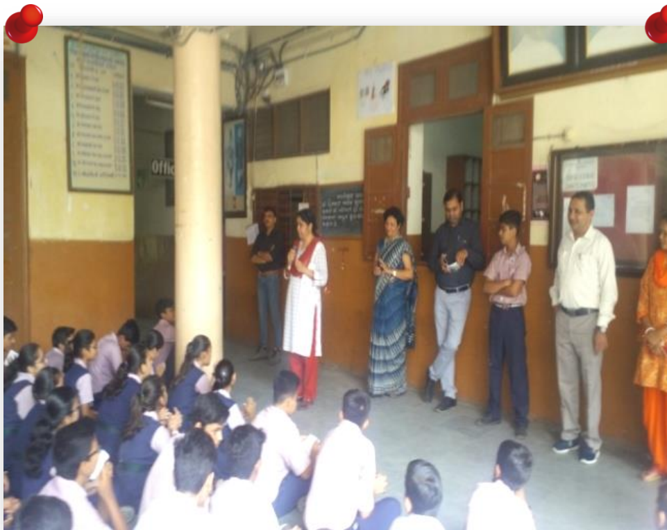
Session on “Life Skill” at Deewan Ballubhai and Kanya Uchatar Madhamik Shala

This year his center provided adolescent education to the children of Diwan Ballubhai and Kanya Uchatar Madhyamik Shala Paldi. The focus was on life skills and personal hygiene. Because of Covid- 19 pandemic we had to cancel our programs with other schools.