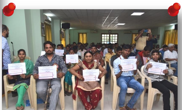
Awardees with Awards and Certificates