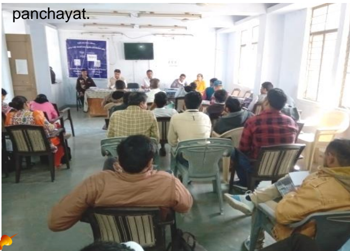
Basic Foundation Training At Jasdan

The feedback received shows that panchayat member are highly appreciative of training and have given very positive response. All the registration forms and feedback form are computerized which have left RUDMI with database of around 10,000 persons working in panchayat.