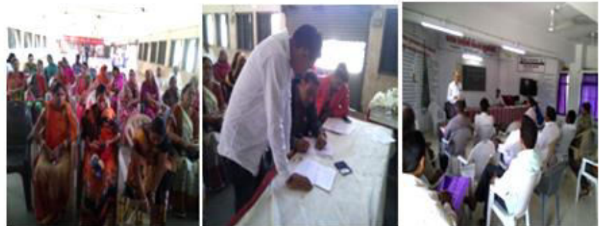
Training at Sutrapada and Girgadhda Taluka Girsomnath District