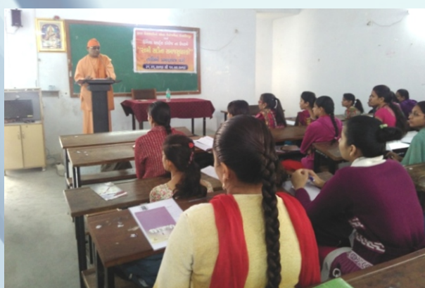
Dr. Babasaheb Ambedkar Swami Vivekanand Ravindranath Tagore Ravishankar Maharaj Maharshi Karve Mahatma Gandhi

A special 3 week (25 hours) program was designed for Umiya College of Girls, Ahmedabad. Some 100 girls registered for this course. The course covered life and works of following reformers.